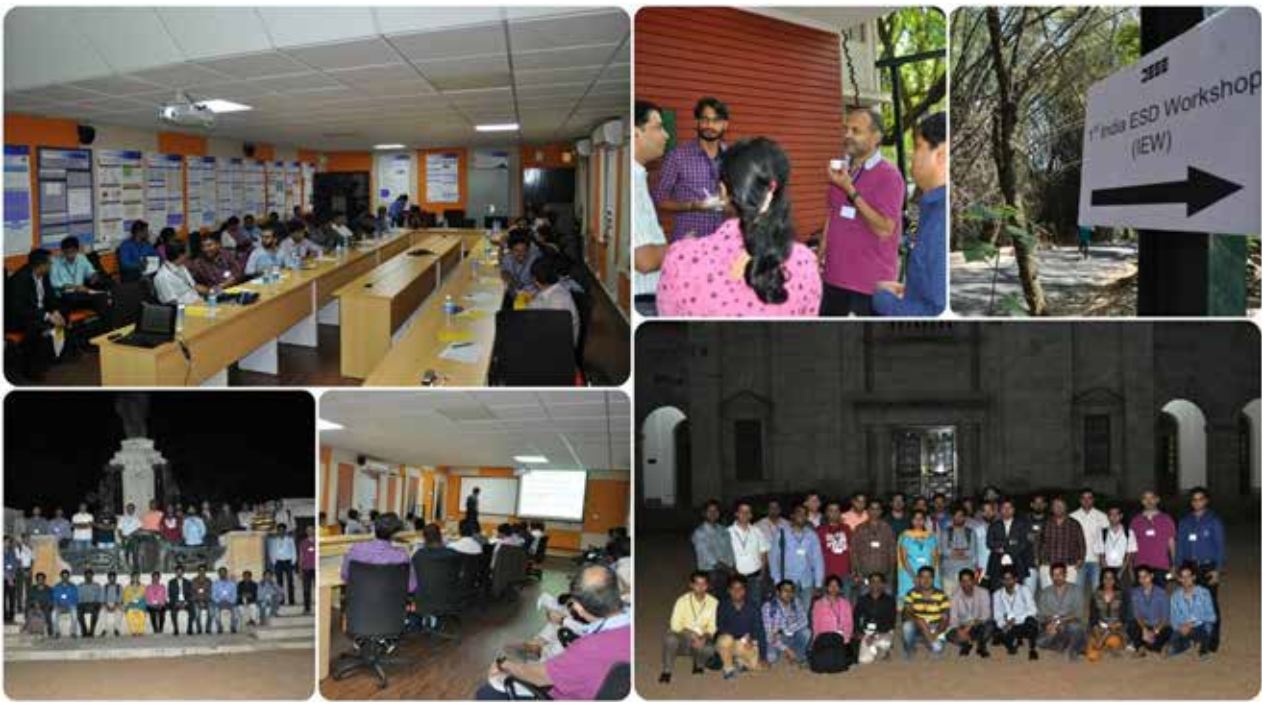
Figure 2: Visuals from the 1st India ESD Workshop.