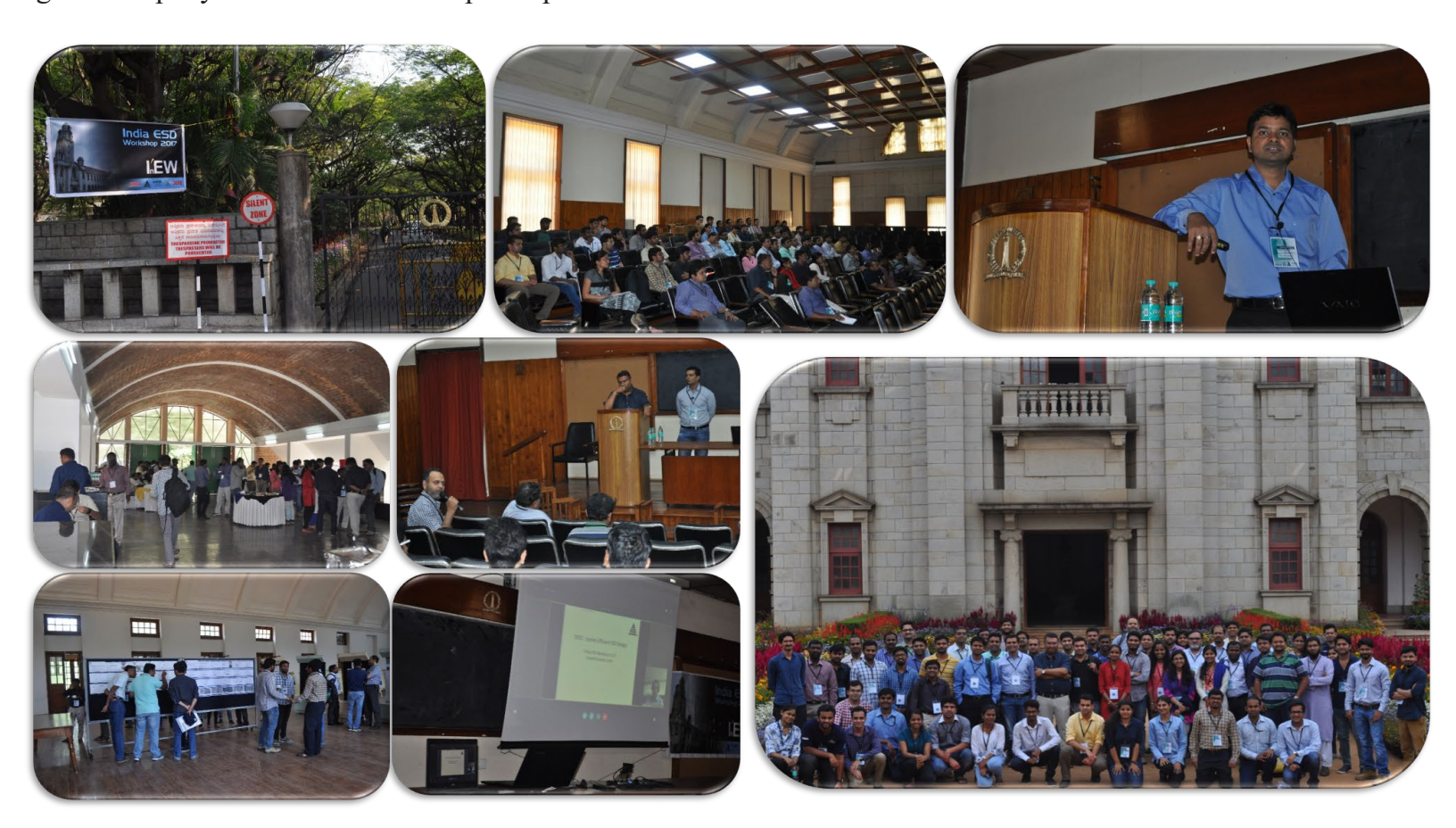
Fig. 2: Visuals from the workshop.